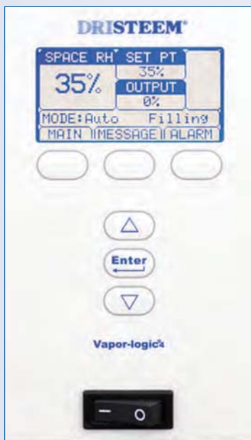
Vapor-logic4 controller keypad/display