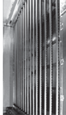
Figure 1-1 Typical dispersion assembly

Shown here is a typical steam dispersion tube panel with un-insulated stainless steel tubes installed to span the full height and width of an air handling unit.