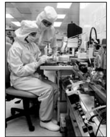
Operators in a clean room 2

Indoor RH control has become a critical need, and the number of commercial and industrial steam humidification systems in the world has never been higher.