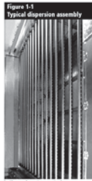
Shown here is a typical steam dispersion tube panel with insulated stainless steel tubes installed to span the full height and width of an air handling unit.

Direct steam injection humidification systems disperse steam into duct or AHU airstreams from on-site boilers or unified steam generators. Unique to direct steam injection applications is the dispersion of pressurized steam.