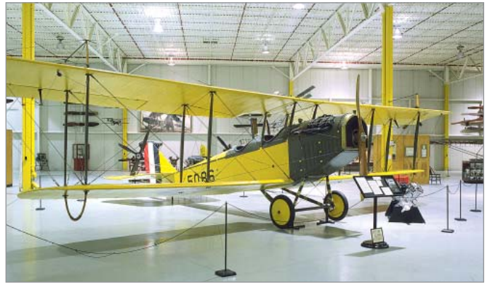
The Glenn H. Curtiss Museum in Hammondsport, New York utilizes a DriSteem GTS ® gas humidifier to preserve historical artifacts and reduce energy costs.

The Curtiss museum is filled with hundreds of objects containing a variety of materials (wood, canvas, fabric and paint) that are subject to cracking, chipping, peeling and distortion without proper humidity levels – ideally 40% to 60% relative humidity (RH). When the Curtiss Museum opened, a humidification system was not installed, and the RH level hovered between 3% and 10%. Jim White, the museum's engineer, knew that he needed to maintain humidification at an RH level of at least 40% with minimal fluctuation ( \pm 3\% ) – or jeopardize the preservation of the museum's contents.